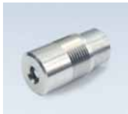
Reverse Flow Valve (RF)