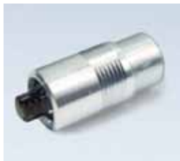
Forward Flow Valve (FF)

The KOENIG CHECK VALVE® is simple to install and a reliable solution to control flow directions in fluid systems.