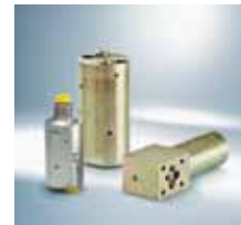
Pressure intensifiers 3)