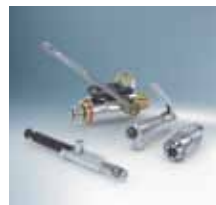
Quick connectors 4)