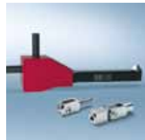
Special processes 2)