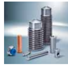
Stud welding systems 1)