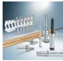
Blind rivet technology