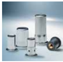
Blind rivet nuts