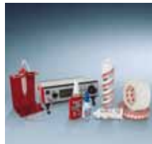
Adhesives and sealants 1)