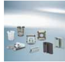
Quick fastening elements and clips