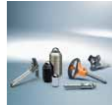
Quick release pins and spring plungers