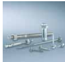
Construction fasteners 2)